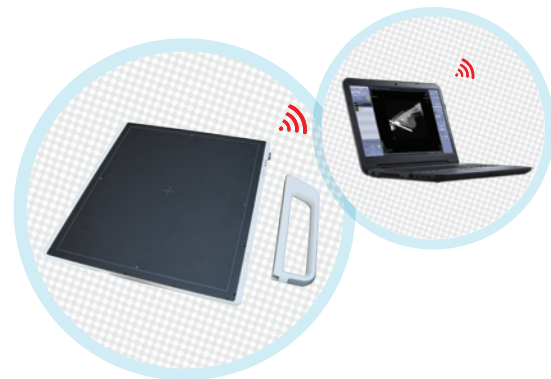
Optional solution - Mobile DR Can be combined with flat panel detector for digital solution