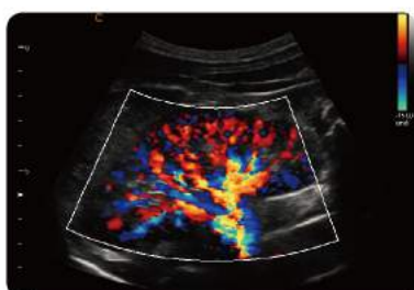
Kidney, C Mode