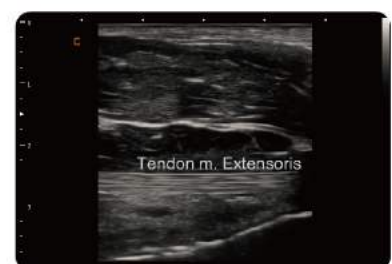
Tendon m. Extensoris, B Mode