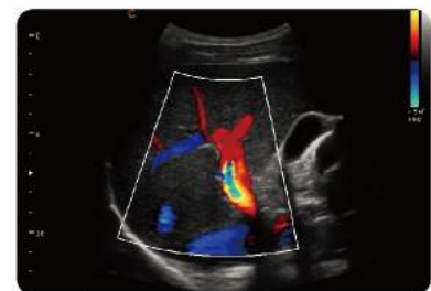
Portal Vein, C Mode