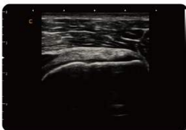
Shoulder, B Mode